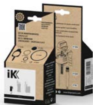
IK HC 1.5 MAINTENANCE KIT Reference 8.17.74.874

Keep your sprayer always ready and get maximum performance