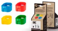
CONTENT IDENTIFIER IK 1.5/2 Reference 8.16.71.900

Adapter for HC model that allows coupling of different nozzles and accessories.